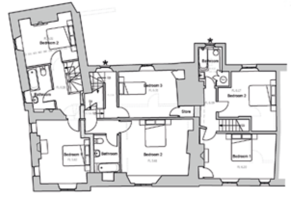
Proposed First Floor Plan