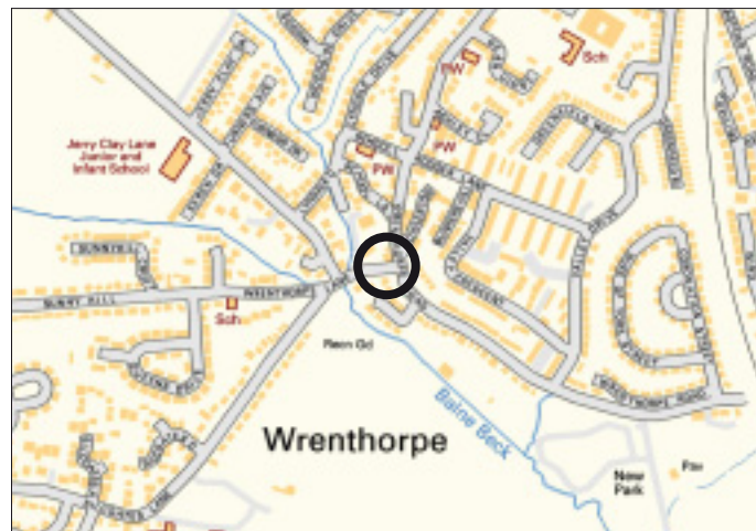
Not to scale. For identification purposes only

11 vacant freehold adjoining plots of land which form part of a 4.17 acre site to be offered as four X 2 plots and one X 3 Plots. The land would be suitable for a variety of different uses subject to any necessary planning consents to include possible mobile telephone masts, however potential purchasers should make their own enquiries. The plots have right of way over adjoining land by foot on the footpath shown in blue at all times day or night and can be found just past Fox Lane.