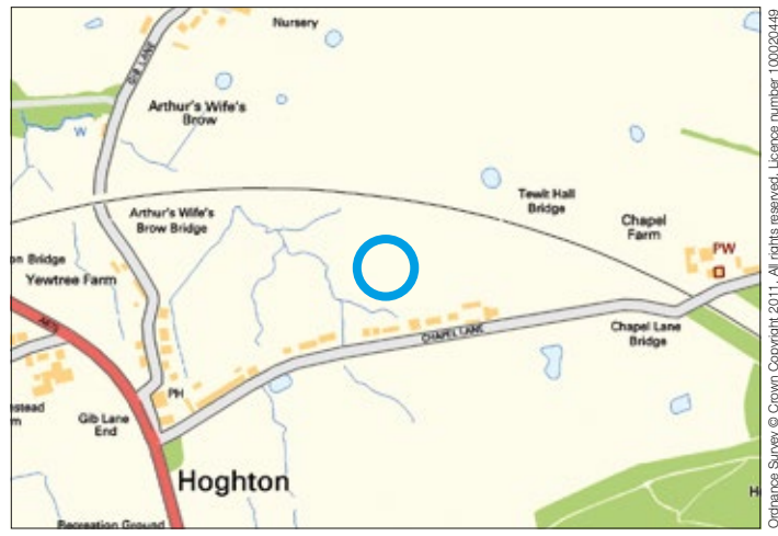
Not to scale. For identification purposes only

Description A freehold agricultural site approximately 1 acre and suitable for a variety of uses, subject to any necessary consents.