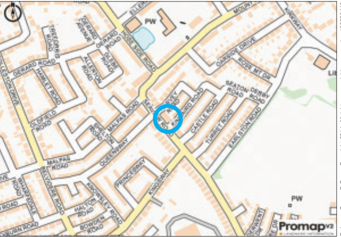
Not to scale. For identification purposes only

Description A substantial three storey 8 bedroomed double fronted dormer style middle terraced property benefiting from partial central heating and a rear garden. Following a full upgrade and scheme of refurbishment works the property would be suitable for a number of uses to include a single dwelling, conversion to self contained flats, or alternatively a HMO Investment opportunity, subject to any necessary consents.