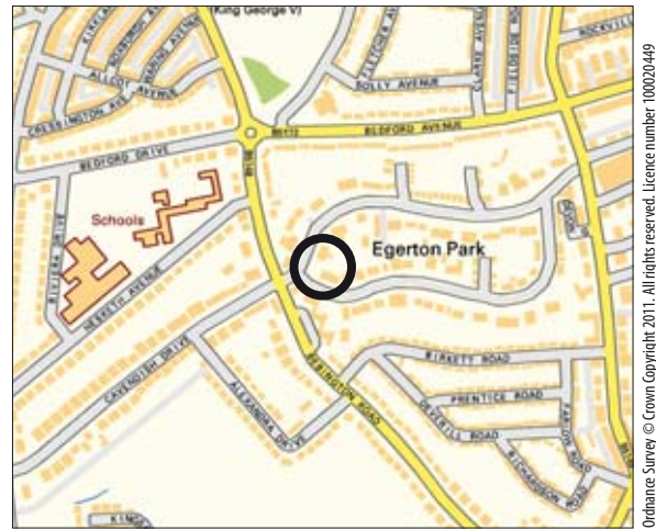
Not to scale. For identification purposes only

Planning permission has been granted by Wirral Council on 25/04/2012 for a change of use from residential care home to 13 apartments under reference APP/11/00430. Copies of the proposed plans are available upon request from the auctioneers.