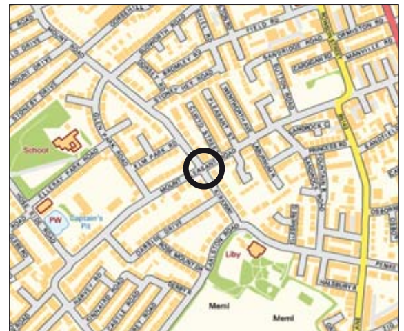
Not to scale. For identification purposes only