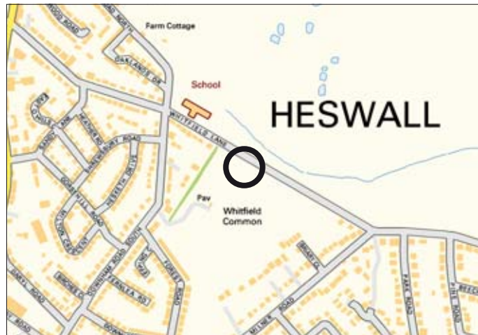
Not to scale. For identification purposes only