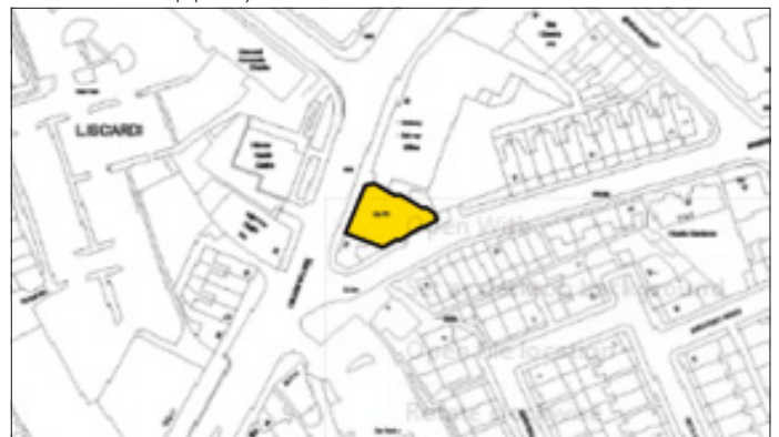
Not to scale. For identification purposes only