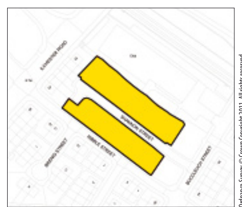
Not to scale. For identification purposes only