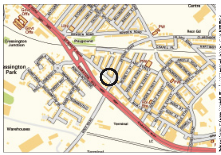
Not to scale. For identification purposes only

providing easy access to Garston Village amenities and approximately 5 miles from Liverpool City Centre.