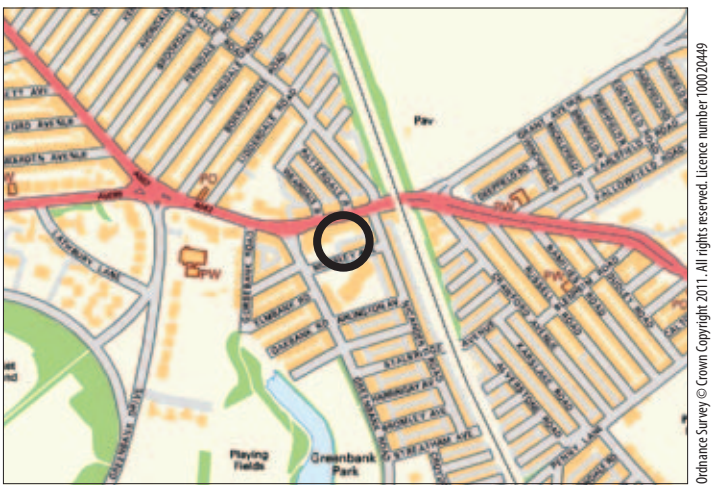
Not to scale. For identification purposes only