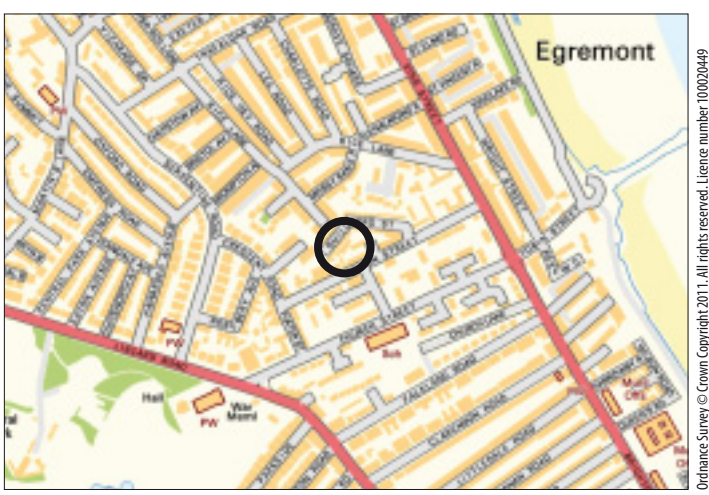
Not to scale. For identification purposes only