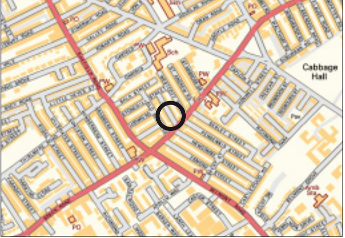
Not to scale. For identification purposes only