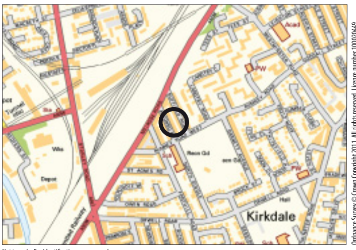
Not to scale. For identification purposes only