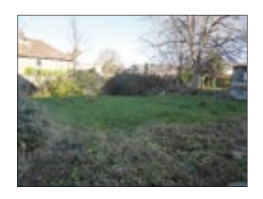
will charge a buyer's premium of £750 plus vat on this Lot.