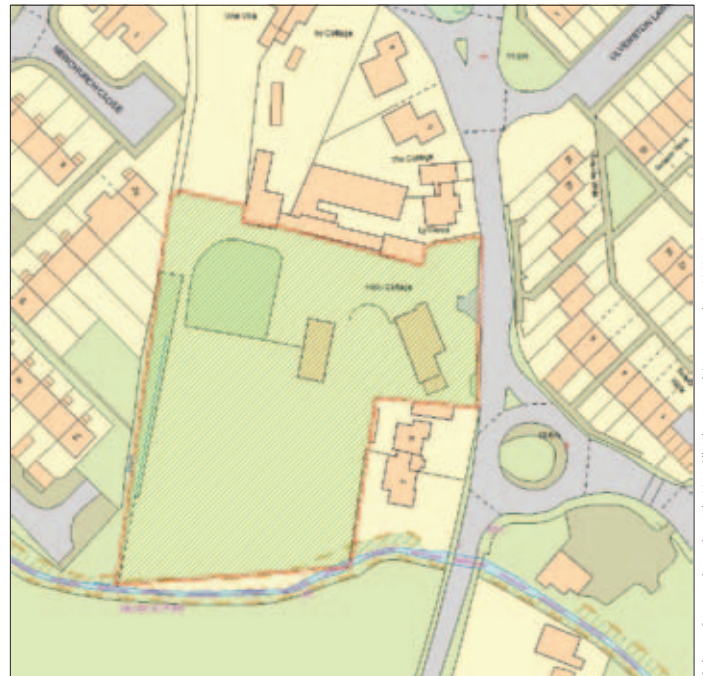
Not to scale. For identification purposes only