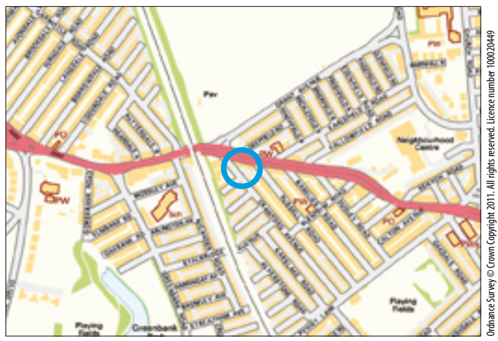
Not to scale. For identification purposes only