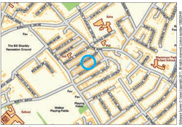
Not to scale. For identification purposes only

A vacant three bedroomed middle terrace property benefiting from double glazing. Following a full upgrade and refurbishment the property would be suitable for occupation, resale or investment purposes.