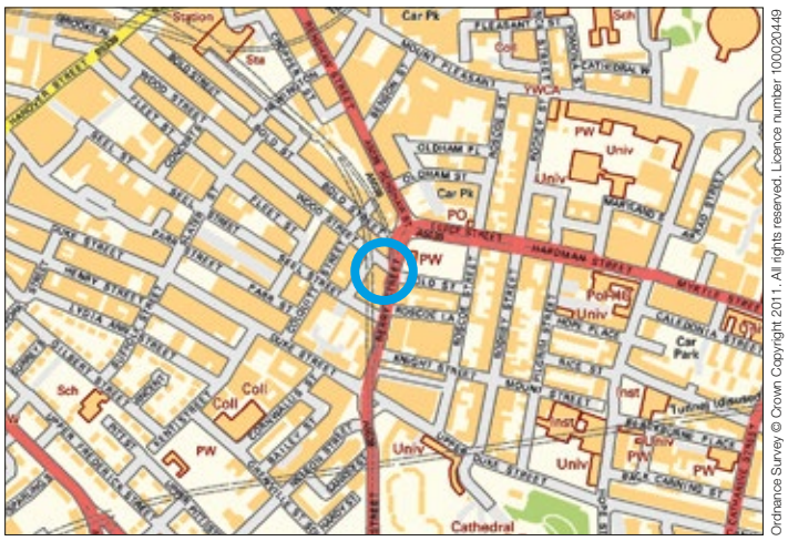
Not to scale. For identification purposes only

Description Plot of land approximately 80m² with lapsed planning permission for two flats (a three bedroom flat and a five bedroom penthouse duplex) but could be easily converted into three flats. The land would be suitable for development subject to gaining the necessary consents. Planning number 09F/0730