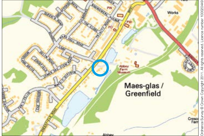
lot to scale. For identification purposes only

Plans are available via the planning section of the Flintshire.gov.uk website.