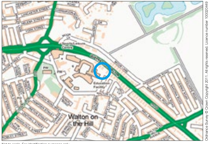
Not to scale. For identification purposes only

Description A spacious 5 bedroomed semi-detached property which has undergone some refurbishment works to include a rewire, new plumbing, new central heating system, double glazing, and it has re-plastered throughout. Following completion of the current works the property would be suitable for occupation to provide a family home, re-sale or investment purposes. The potential rental income if let to 6 tenants at £74pppw is in excess of £23,500 per annum.