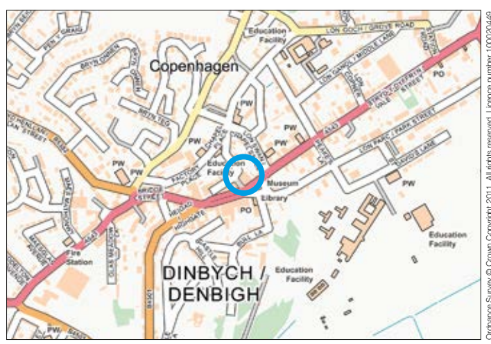
Not to scale. For identification purposes only

Description A three storey four bedroomed modern town house property benefiting from double glazing, central heating, allocated parking and a decked roof terrace. The property is currently let by way of an Assured Shorthold Tenancy producing £7,200 per annum.